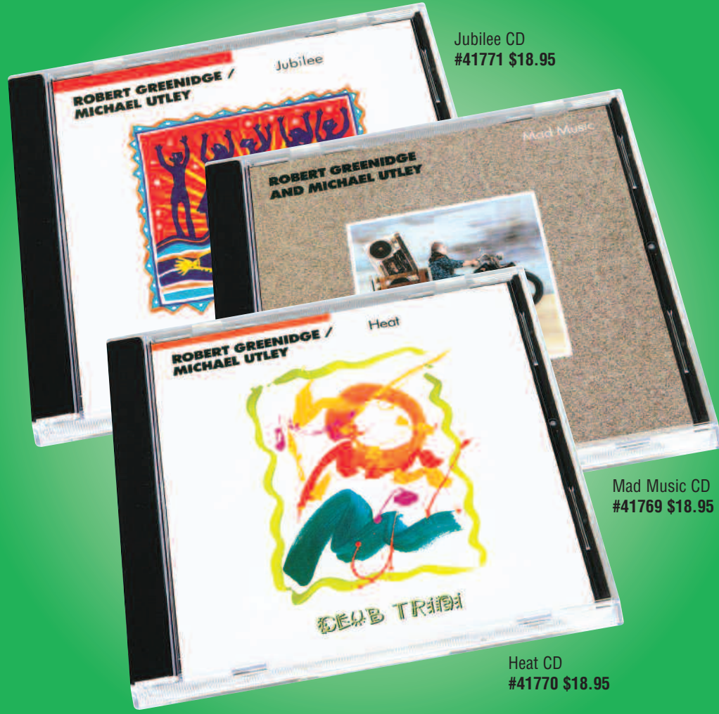
Jubilee CD #41771 $18.95