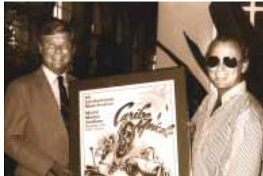
Jimmy with Senator Bob Graham promoting the Caribbean Music Festival.

Jimmy landed on the New York Times Best Sellers list for over seven months with his first book, Tales From Margaritaville / Fictional Facts and Factual Fictions . Long hailed as a "genius at storytelling," Jimmy replaces lyrics with prose in his first collection of short stories, Tales From Margaritaville . Jimmy appeared on the Larry King talk show to promote the book, and discussed among other things the following: