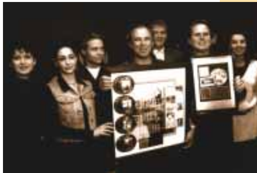
Boxed set goes triple platinum.