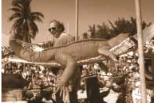
Smather's Beach Feeding Frenzy Release Party