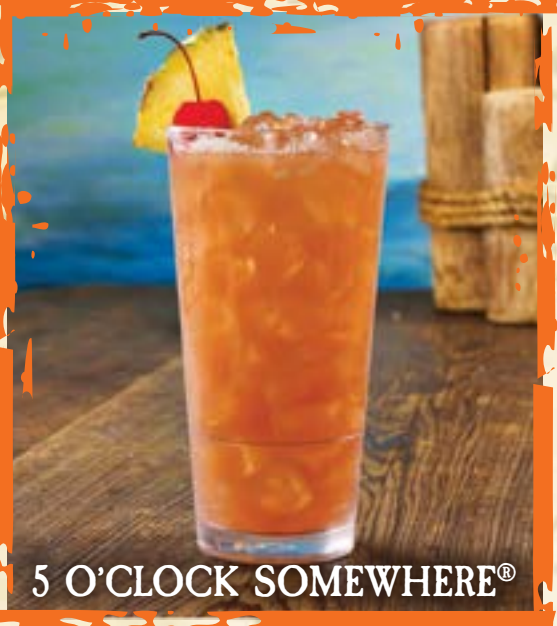
5 O'CLOCK SOMEWHERE®

This cool blue concoction of Cruzan® Mango Rum, Bols® Blue Curaçao, pineapple juice and mango. Served on the rocks