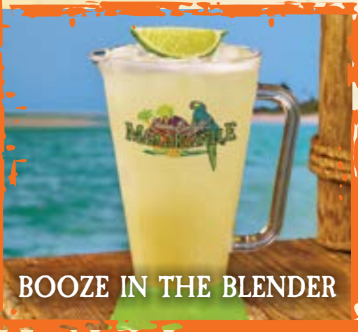
BOOZE IN THE BLENDER

Margaritaville Silver Tequila, Bols® Blue Curaçao and our house margarita blend. Served on the rocks