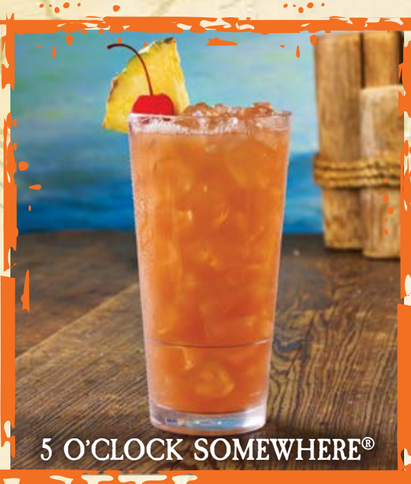
5 O'CLOCK SOMEWHERE®

Appleton® Estate Signature Blend Rum, Sailor Jerry® Spiced Rum, our house sweet & sour, pineapple juice, pomegranate and a dash of bitters. Served on the rocks