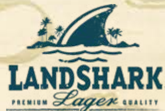
LANDSHARK® PREMIUM Lager QUALITY