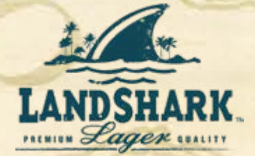
LANDSHARK® PREMIUM Lager QUALITY