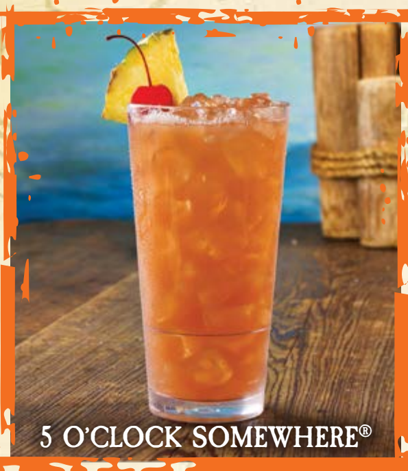
5 O'CLOCK SOMEWHERE®

Appleton® Estate Signature Blend Rum, Sailor Jerry® Spiced Rum, our house sweet & sour, pineapple juice, pomegranate and a dash of bitters. Served on the rocks