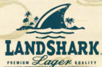
LANDSHARK® PREMIUM Lager QUALITY

LOADED LANDSHARK® Try a LandShark® Lager topped off with Margaritaville Island Lime Tequila