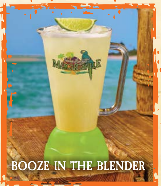
BOOZE IN THE BLENDER

GET THE MOST OUT OF YOUR BLENDER CUP WITH OUR REFILL OFFERS!