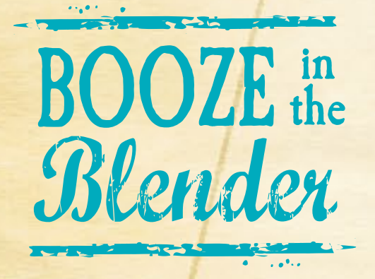
ASK FOR OUR WHO'S TO BLAME® OR TROPICAL FRUIT MARGARITA IN A 22 OZ TAKE-HOME BLENDER CUP FOR AN ADDITIONAL $8.00

Margaritaville Silver Tequila, Cointreau® Orange Liqueur, blueberry pomegranate purée and our house margarita blend $9.50