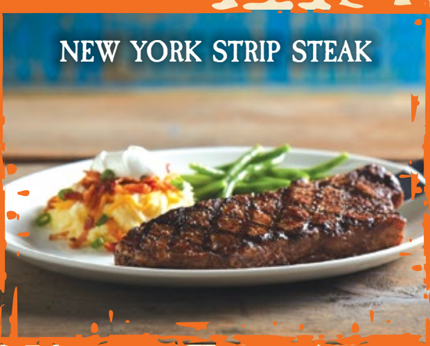
NEW YORK STRIP STEAK

Hand-battered fried chicken, applewood-smoked bacon, avocado, tomato, bleu cheese and hard-boiled eggs tossed with honey mustard dressing $16.99