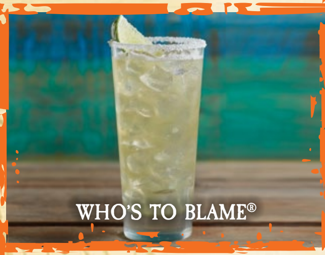
WHO'S TO BLAME®