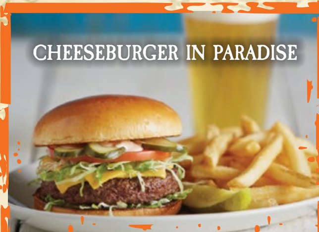
CHEESEBURGER IN PARADISE

Oven roasted salmon, glazed with our signature bourbon sauce. Served with seasoned rice and Chef's choice of vegetable $20.99