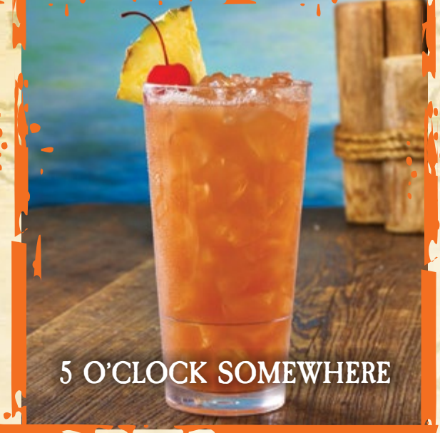
5 O'CLOCK SOMEWHERE

Your choice of 5 bottles on ice: DOMESTIC $30.25 • PREMIUM $34.25 SPECIALTY OR MIX IT UP $35.00