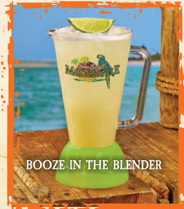
BOOZE IN THE BLENDER

Margaritaville Gold Tequila, triple sec and your choice of all-natural fruit purée: strawberry, raspberry or mango. Served frozen $10.75