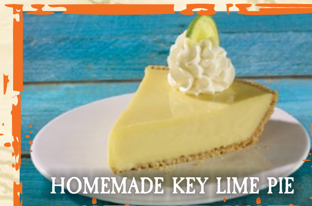
HOMEMADE KEY LIME PIE

Our signature key lime pie, made from scratch daily (get yours while supplies last!) $7.99