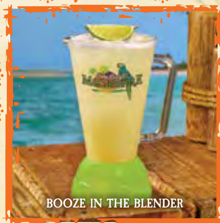
BOOZE IN THE BLENDER

Corazon® Blanco Tequila, Margaritaville Triple Sec, wildberry purée, and our house margarita blend. Served on the rocks (280 calories)