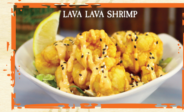
LAVA LAVA SHRIMP

Hand-breaded dill pickle chips, served with our ranch dipping sauce (680 calories) $12.99