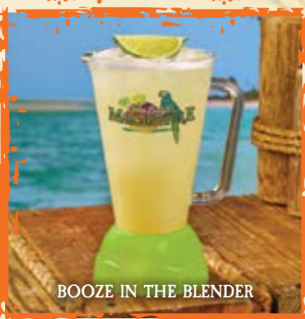
BOOZE IN THE BLENDER

GET THE MOST OUT OF YOUR BLENDER CUP WITH OUR REFILL OFFERS!