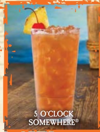
5 O'CLOCK SOMEWHERE®

RED PINOT NOIR Prophecy, California MERLOT Chateau Souverain, California RED BLEND Apothic, California MALBEC Alamos, Argentina CABERNET SAUVIGNON Athena, California