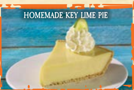
HOMEMADE KEY LIME PIE

Topped with Monterey Jack cheese, applewood-smoked bacon, lettuce, tomato, pickles and ranch dressing**