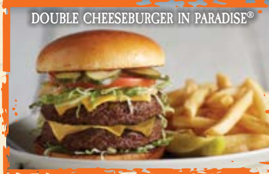
DOUBLE CHEESEBURGER IN PARADISE®

Shredded iceberg lettuce, seasoned ground beef, cheddar and Monterey Jack cheese, diced tomatoes, black beans, diced cucumbers, roasted corn and avocado tossed in ranch dressing, topped with crispy tortilla strips, queso fresco and cilantro. Served with fresh guacamole and sour cream