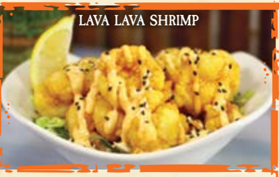
LAVA LAVA SHRIMP

Hand-breaded dill pickle chips, served with our ranch dipping sauce