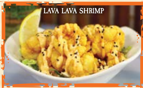
LAVA LAVA SHRIMP

Hand-breaded dill pickle chips, served with our ranch dipping sauce