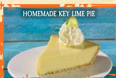
HOMEMADE KEY LIME PIE

Topped with Monterey Jack cheese, applewood-smoked bacon, lettuce, tomato, pickles and ranch dressing**