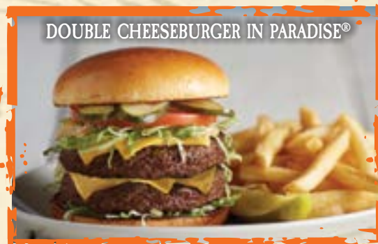
DOUBLE CHEESEBURGER IN PARADISE®

Shredded iceberg lettuce, seasoned ground beef, cheddar and Monterey Jack cheese, diced tomatoes, black beans, diced cucumbers, roasted corn and avocado tossed in ranch dressing, topped with crispy tortilla strips, queso fresco and cilantro. Served with fresh guacamole and sour cream