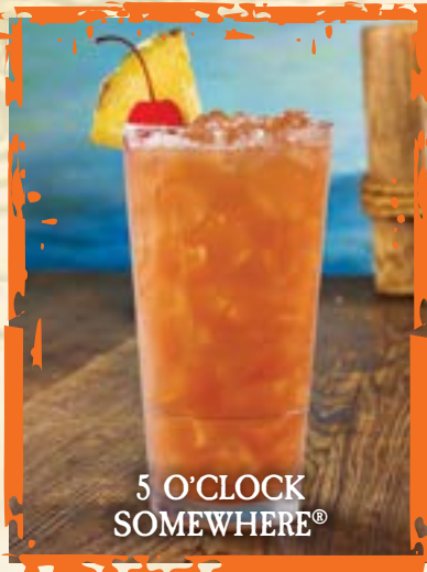
5 O'CLOCK SOMEWHERE®

RED PINOT NOIR Prophecy, California MERLOT Chateau Souverain, California RED BLEND Apothic, California MALBEC Alamos, Argentina CABERNET SAUVIGNON Athena, California