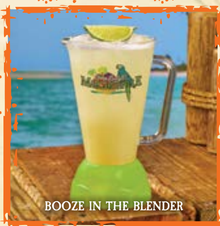
BOOZE IN THE BLENDER

Corazon® Blanco Tequila, Margaritaville Triple Sec, wildberry purée, and our house margarita blend. Served on the rocks (280 calories)