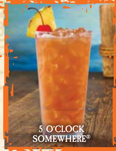
5 O'CLOCK SOMEWHERE®

RED PINOT NOIR Prophecy, California (150-630 calories) MERLOT Chateau Souverain, California (150-630 calories) RED BLEND Apothic, California (170-710 calories) MALBEC Alamos, Argentina (120-510 calories) CABERNET SAUVIGNON Athena, California (130-660 calories)