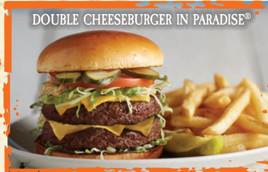
DOUBLE CHEESEBURGER IN PARADISE®

Shredded iceberg lettuce, seasoned ground beef, cheddar and Monterey Jack cheese, diced tomatoes, black beans, diced cucumbers, roasted corn and avocado tossed in ranch dressing, topped with crispy tortilla strips, queso fresco and cilantro. Served with fresh guacamole and sour cream (1330 calories) $18.99