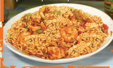
JIMMY'S JAMMIN' JAMBALAYA®

Our Hand-Battered Chicken Tenders served with French fries and your choice of Buffalo, honey mustard or BBQ sauce (1380-1540 calories) $17.99