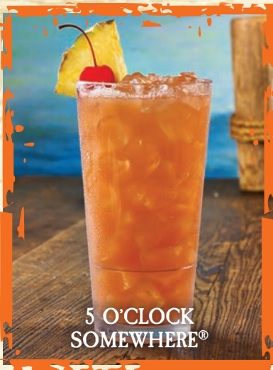
5 O'CLOCK SOMEWHERE®

PINOT NOIR Prophecy, California (150-630 calories) MERLOT Chateau Souverain, California (150-630 calories) RED BLEND Apothic, California (170-710 calories) MALBEC Alamos, Argentina (120-510 calories) CABERNET SAUVIGNON Athena, California (130-660 calories)