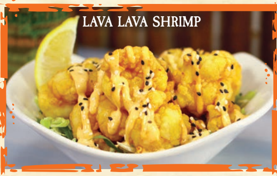
LAVA LAVA SHRIMP

Hand-breaded dill pickle chips, served with our ranch dipping sauce (680 calories) $12.99