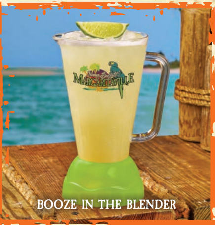
BOOZE IN THE BLENDER

GET THE MOST OUT OF YOUR BLENDER CUP WITH OUR REFILL OFFERS!