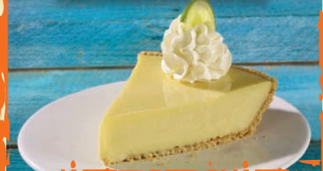
HOMEMADE KEY LIME PIE

Topped with Monterey Jack cheese, applewood-smoked bacon, lettuce, tomato, pickles and ranch dressing** (1010 calories) $16.99