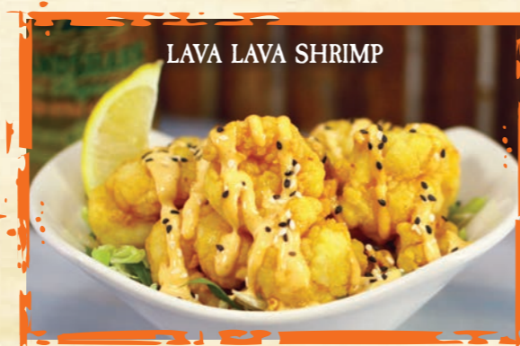
LAVA LAVA SHRIMP

WINGS Fried crispy and tossed with your choice of Buffalo, BBQ, teriyaki or Caribbean jerk sauce. Served with celery sticks and ranch or bleu cheese (1150-1250 calories) $15.50