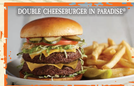
DOUBLE CHEESEBURGER IN PARADISE®

Shredded iceberg lettuce, seasoned ground beef, cheddar and Monterey Jack cheese, diced tomatoes, black beans, diced cucumbers, roasted corn and avocado tossed in ranch dressing, topped with crispy tortilla strips, queso fresco and cilantro. Served with fresh guacamole and sour cream (1330 calories) $17.99