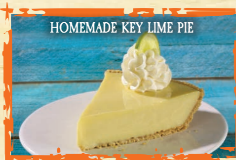
HOMEMADE KEY LIME PIE

Topped with Monterey Jack cheese, applewood-smoked bacon, lettuce, tomato, pickles and ranch dressing** (1010 calories) $15.50