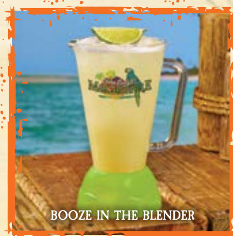
BOOZE IN THE BLENDER

NEW WHERE'S THE PARTY Corazon® Blanco Tequila, Margaritaville Triple Sec, wildberry purée, and our house margarita blend. Served on the rocks (280 calories)