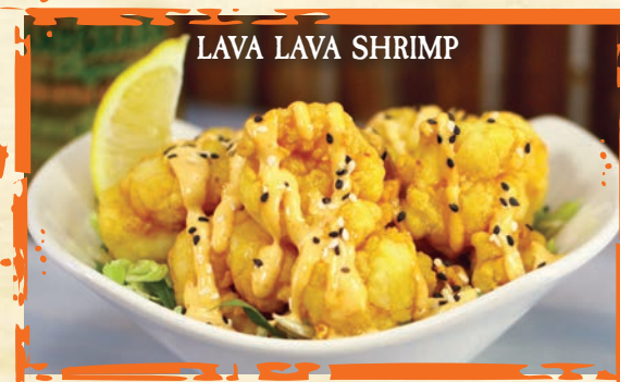
LAVA LAVA SHRIMP

Hand-breaded dill pickle chips, served with our ranch dipping sauce (680 calories) $10.50