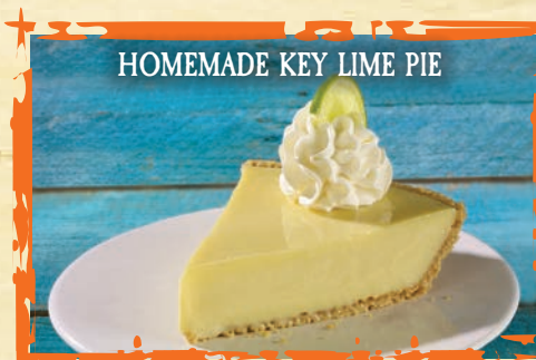
HOMEMADE KEY LIME PIE

Topped with Monterey Jack cheese, applewood-smoked bacon, lettuce, tomato, pickles and ranch dressing** (1010 calories) $15.50