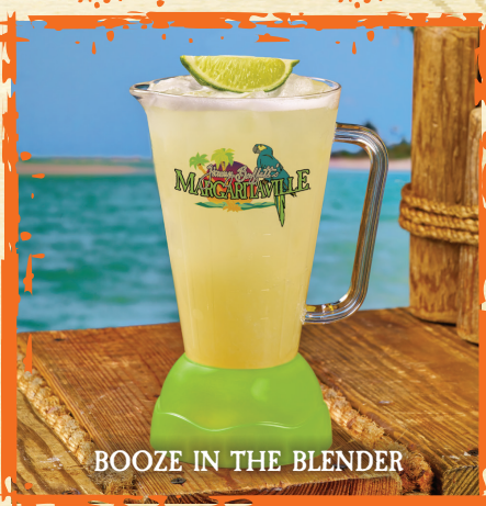
BOOZE IN THE BLENDER

GET THE MOST OUT OF YOUR BLENDER CUP WITH OUR REFILL OFFERS!