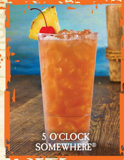
5 O'CLOCK SOMEWHERE®