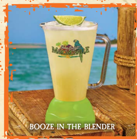
BOOZE IN THE BLENDER

GET THE MOST OUT OF YOUR BLENDER CUP WITH OUR REFILL OFFERS!