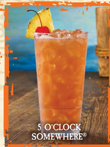
5 O'CLOCK SOMEWHERE®

RumHaven® Coconut Rum, Tropical Red Bull®, orange and pineapple juices. Served on the rocks (180 calories) $9.00