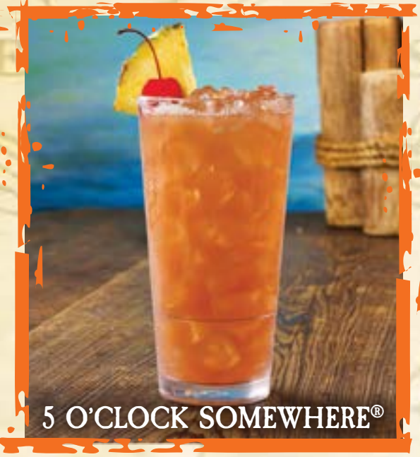
5 O'CLOCK SOMEWHERE®

Bacardi® Lime, RumHaven® Coconut Rum, Coconut Berry Red Bull® and our premium citrus sweet & sour. Served on the rocks