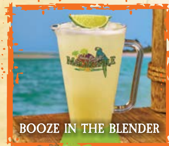
BOOZE IN THE BLENDER

Margaritaville Silver Tequila, Bols® Blue Curacao and our house margarita blend. Served on the rocks