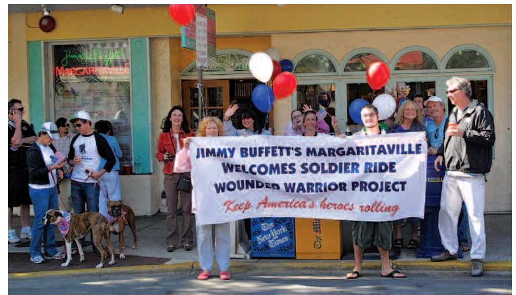
Margaritaville Welcomes Soldier Ride