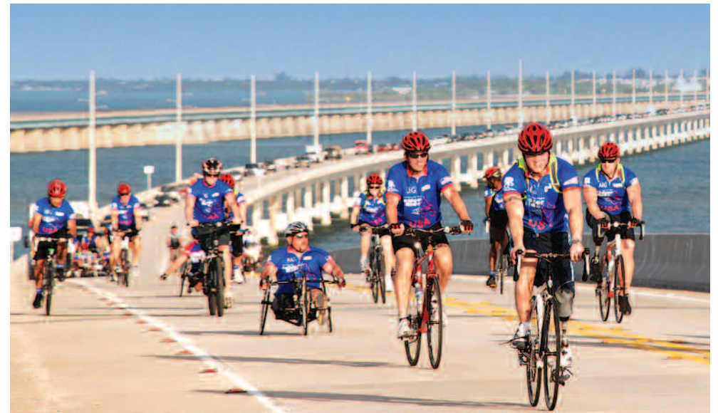
Wounded Warrior's Conquer Keys Bridge

Volunteers told us how therapeutic this trip had been, that many of the men had not been so animated or alive in months. We are so proud to have been a part of it, so pleased that many others in town were involved, and so appreciative of the Soldier Ride organization for sharing their cause.