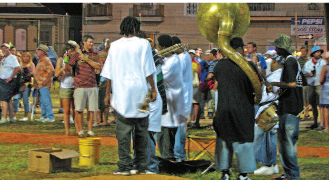
Impromptu performance while waiting for a cab

During Come Monday, the sweet, reflective ballad of lingering love, an airplane towing a Hustler's Club banner circled the fairgrounds. Jimmy deadpanned, "I've got a lot better songs to play for that." And later Jimmy spotted a fan wearing the Margaritaville Store T-shirt, "Rebuilding New Orleans One Margarita At A Time," and offered to trade his flip flops for the shirt. The T-shirt immediately was tossed on stage and our bare-chested balladeer slipped it on. The steamy Saturday afternoon caused Jimmy to shout, "man, that's a funky-ass T-shirt!"