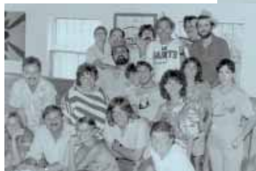
Winners of 1985's Last Mango Cruise