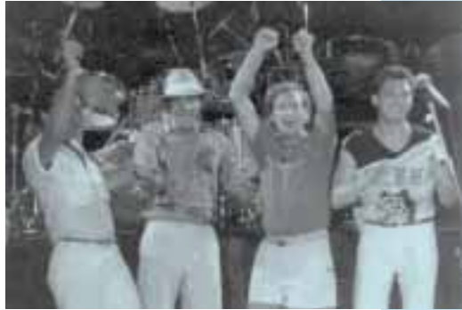
Live By The Bay Encore