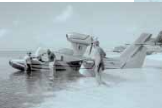
Jimmy with first seaplane