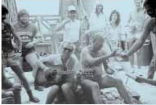
Jimmy with Mel Fisher, “Today Is The Day”

The Parrot Looks At Forty Tour began in June, 1987 and a review in Nashville’s Tennessean noted that, “There are few concert experiences as downright fun as