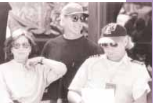
With producers on the set of Congo