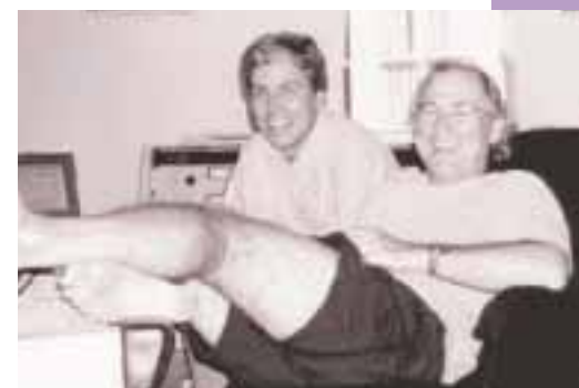
With Carl Hiaasen in the studio