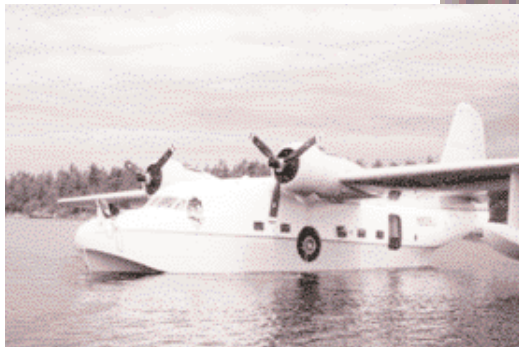
The Hemisphere Dancer afloat