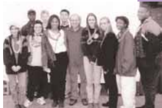
With Seacamp Scholarship winners