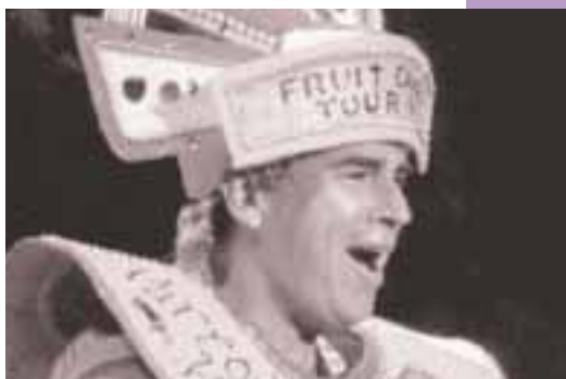
There's a little fruitcake in everyone of us.